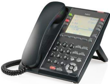
SL2100 IP Terminal