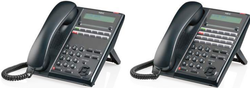
SL2100 Multi-line Terminals