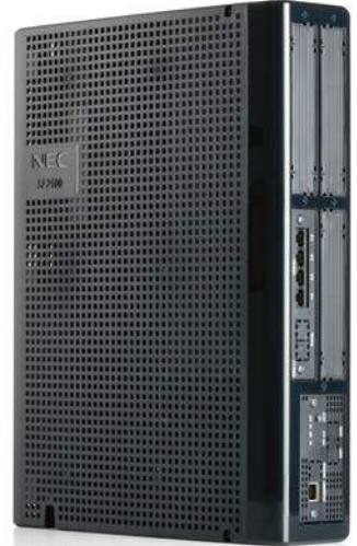
SL2100 Communications Server